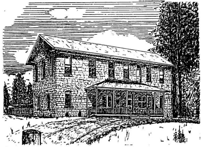
Arizona Historical Society Pioneer Museum